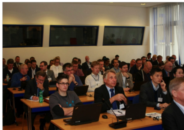
The CEPT workshop on 5G gathered approximately 150 participants